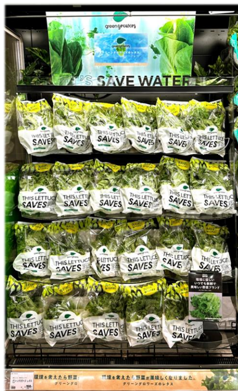
Photo: Shelves of Green Growers lettuce. Delivered to the stores within 24 hours from harvesting.

We founded "THE TERRABASE Tsuchiura" plant factory in collaboration with PLANTX in June 2022 to provide greater value for customers through Green Growers. The delivery system was built through SPF model that U.S.M.H involves the entire process from product development to production, distribution, and sales. It allows to bring ultra-fresh lettuce in stores within 24 hours from harvesting. Additionally, the lettuce cultivated in the fully sealed and mechanized plant factory using PLANTX's technology does not require washing before eating and boasts crisp texture with high nutritional value. The factory consistently ships lettuce to approximately 200 stores every day.